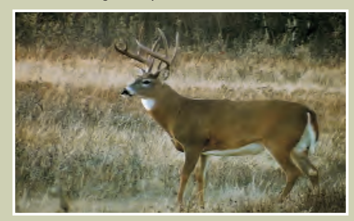
This photo was taken two weeks later and shows the 5x4 frame the buck grew that year.

change from camera to weapon in a quiet, efficient manner. As the buck began to move past the blind, the manner shifted slightly into organized panic. A gun was eventually stuck out the window and a bullet sent on its way. At the shot, this particularly elusive whitetail pulled another disappearing act, this time into the soupy gloom of the snowstorm.