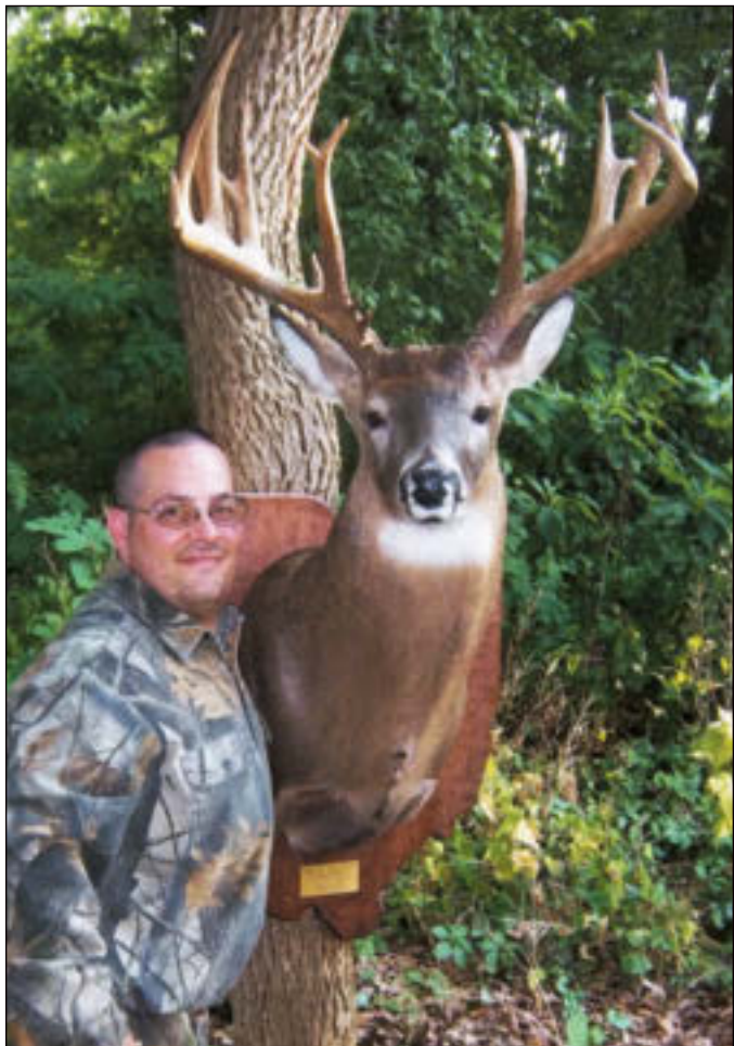
Another look at this 11x7 Ohio whitetail.

I was very excited and hyperventilating when I climbed down the ladder. I missed the last three steps and went face first into the tree. I split my forehead wide open and was a real mess when I walked into the house. My wife panicked when she saw all the blood, but all I could come up with was "I GOT BIG BOY!" She cleaned up my face, and the rest of the night was a restless one as I worried about my elusive buck.