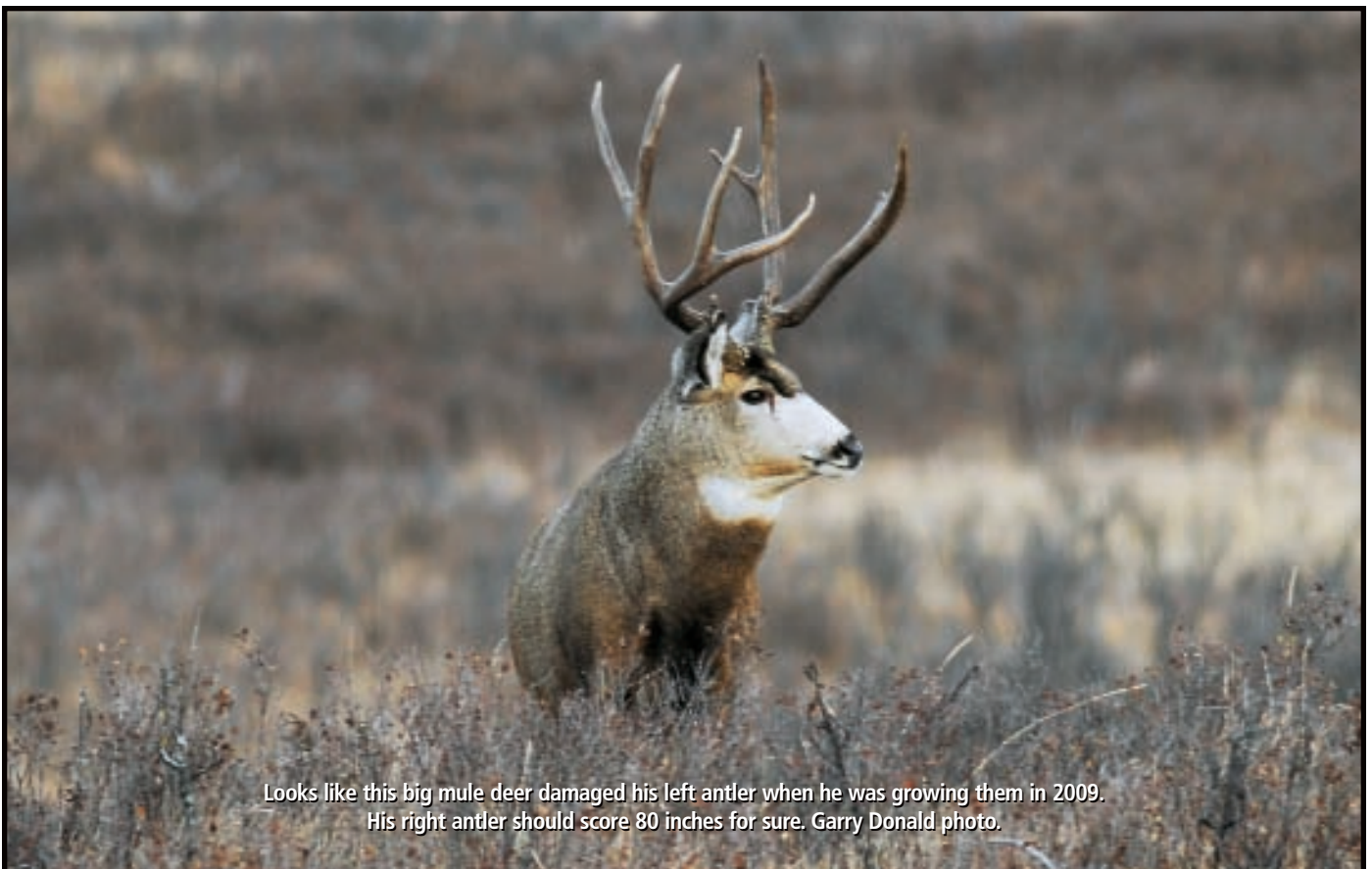
Looks like this big mule deer damaged his left antler when he was growing them in 2009. His right antler should score 80 inches for sure.

Another look at the trophy buck and the beautiful country where it lived.