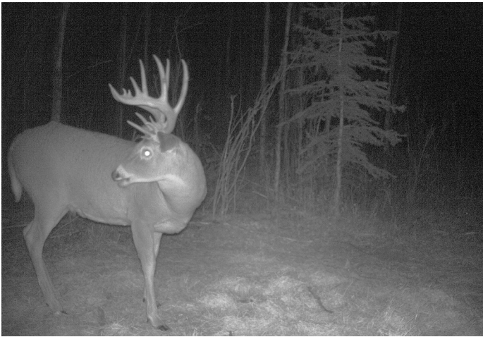
Now in hard horn, the buck was still sticking to its nocturnal ways.

As I scrolled through the pictures, I came across four images of Crazy Brows and another great 4x4 buck. I was absolutely shocked as the pictures showed them face to face, posturing. The 4x4 had a body that dwarfed Crazy Brows significantly. Immediately I sent the images to Chandler and Derryk. We all agreed the buck was young, but discussed the fact he was on public land that was getting significant amounts of hunting pressure. In the end, with an immense amount of anxiety, I decided to pull the blind and leave Crazy Brows for yet another year.