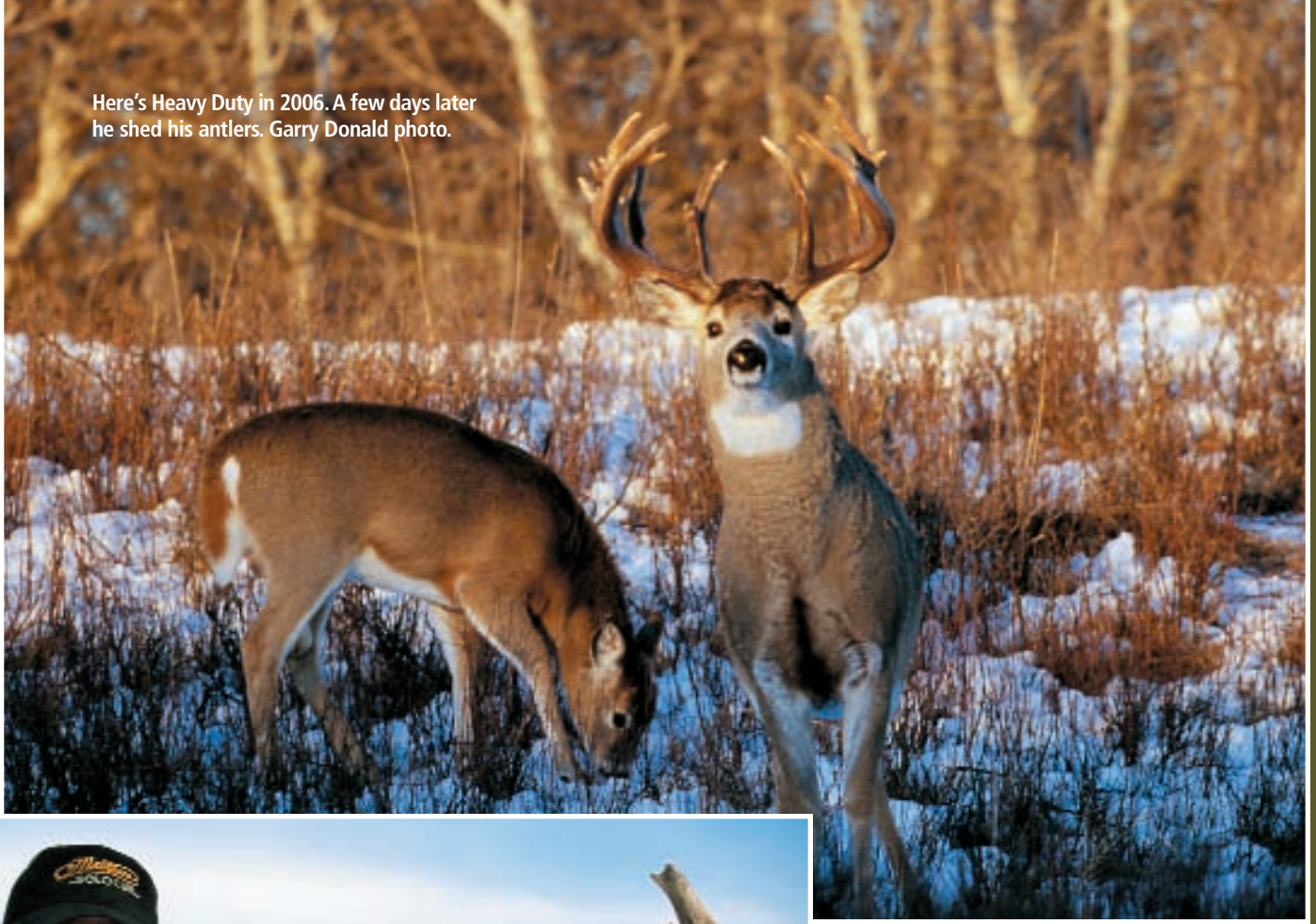
Here's Heavy Duty in 2006. A few days later he shed his antlers.