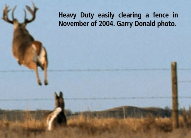
Heavy Duty easily clearing a fence in November of 2004.