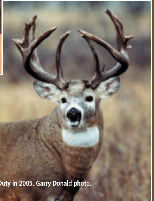
Here's Heavy Duty in 2005.