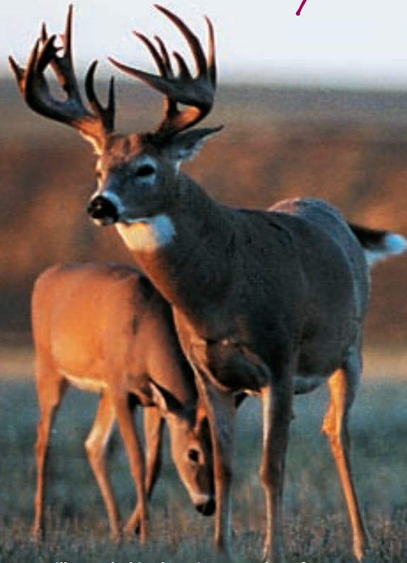
Brian McMillen took this photo in September of 2003.