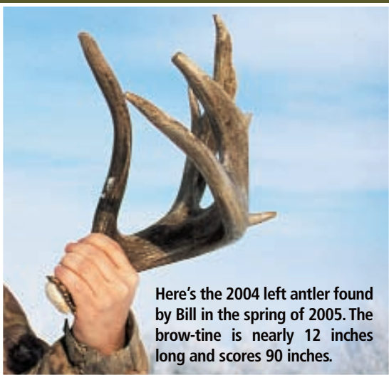
Here's the 2004 left antler found by Bill in the spring of 2005. The brow-tine is nearly 12 inches long and scores 90 inches.