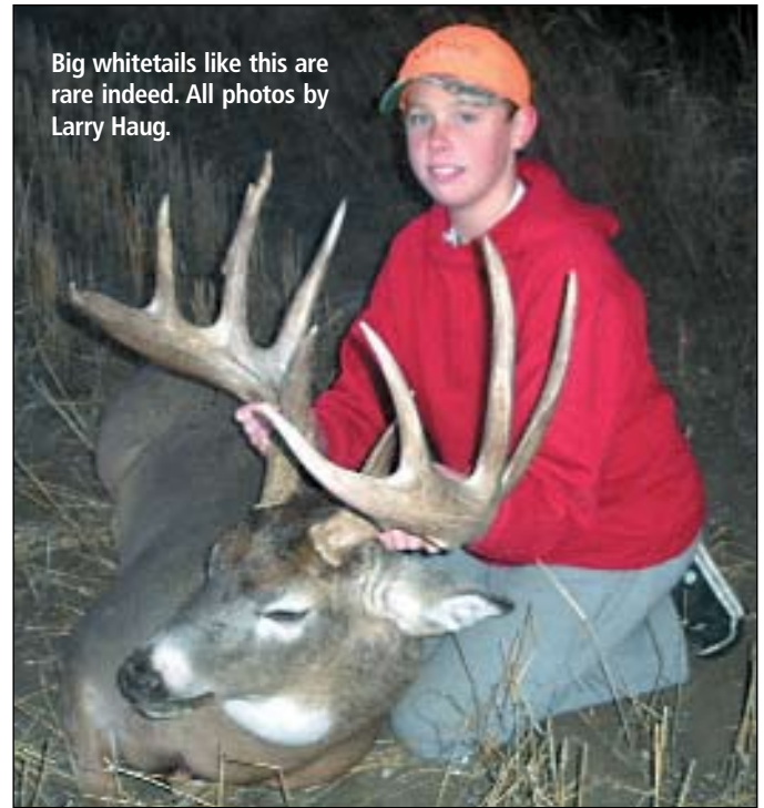
Big whitetails like this are rare indeed.